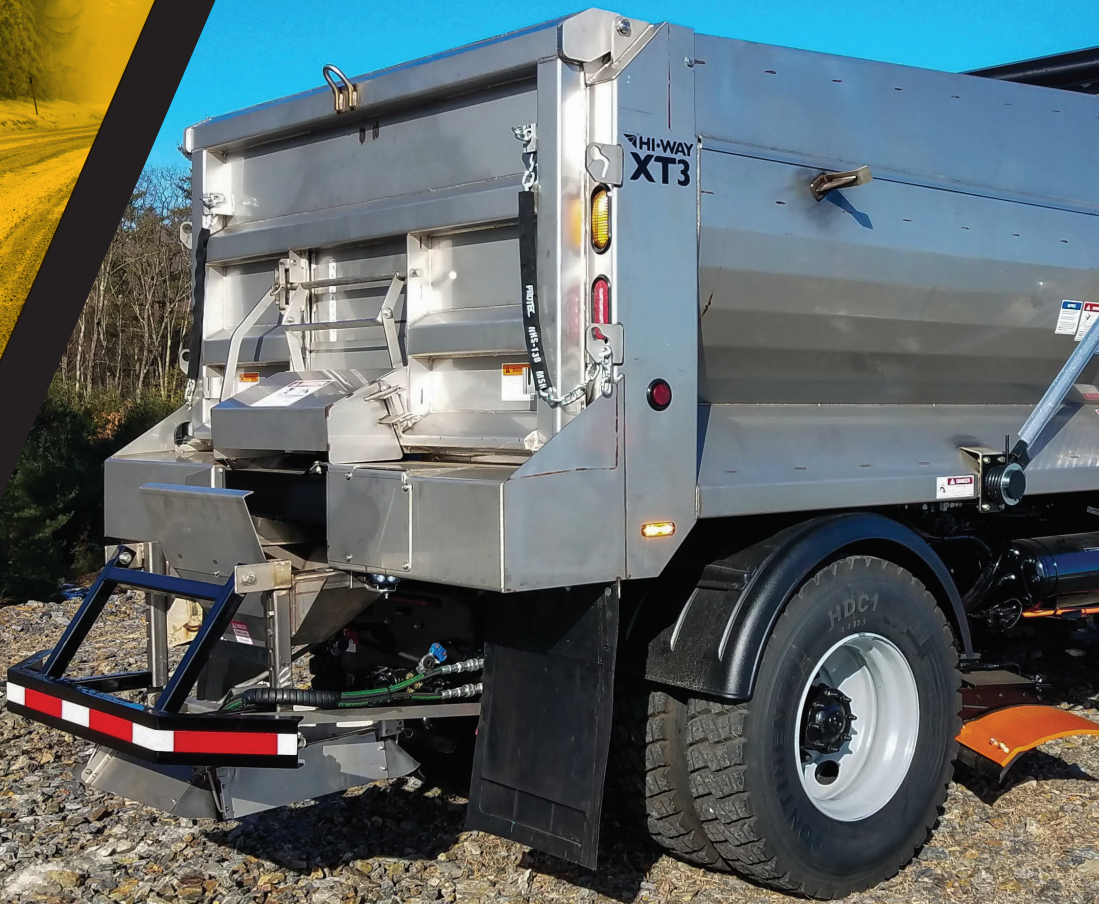
XT3 Type I

Built for unmatched versatility, the XT3 is engineered to haul, spread, and dump with ease—all in one high-performance machine. Featuring industry-leading capacity and a lower center of gravity than comparable-radius bodies, the XT3 hauls more and spreads farther, boosting overall truck productivity.