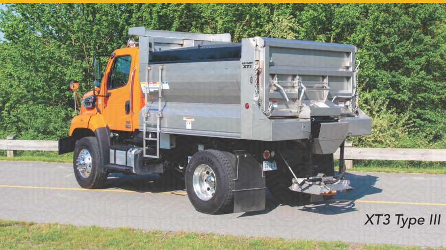
XT3 Type III