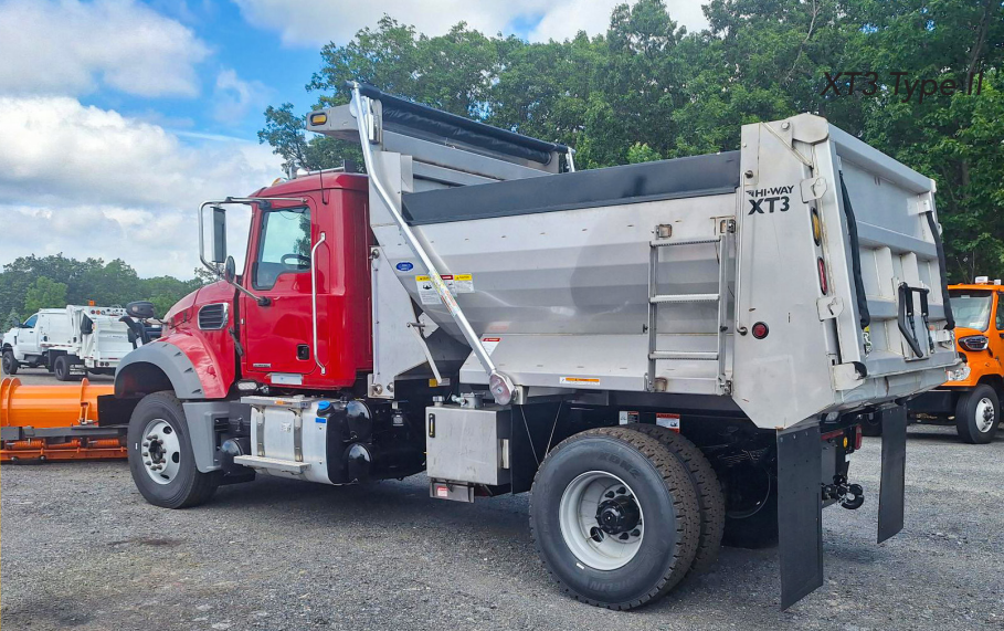
XT3 Type II